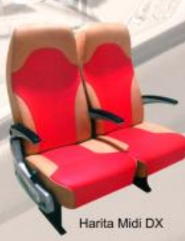
Harita Midi DX