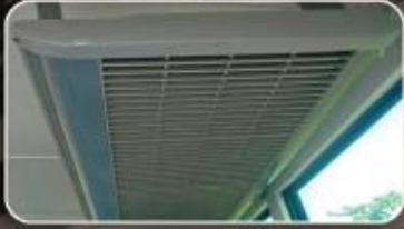
Skylite Hattrack for Non-AC Bus