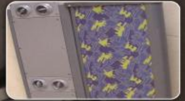
Skyfab Hattrack for AC Bus