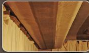
Skymate Hattrack for Non-AC Bus