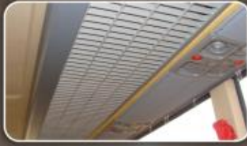
Skylite Hattrack for AC Bus