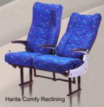
Harita Comfy Reclining